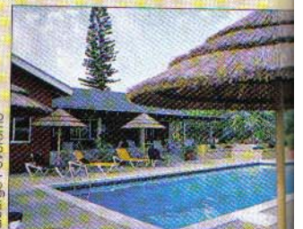
The pool at Hawk's Nest Resort & Marina helps anglers cool off after a hot day of fishing.

targets wahoo in winter; yellowfin, dolphin, blue marlin and late-season wahoo in spring; and blue marlin and dolphin through early summer. From July to October the boat heads to South Jersey, where it can be chartered for canyon runs, tuna trips and tournaments. Private air charters from South Florida to the Bahamas can also be arranged through Over Under Aviation. All-inclusive Bahamas packages range from two nights and one day of fishing, to six nights and five days of fishing. For more information, contact Over Under Adventures, (201) 240-4952; e-mail: info@overunderadventures.com , or visit www.overunderadventures.com .